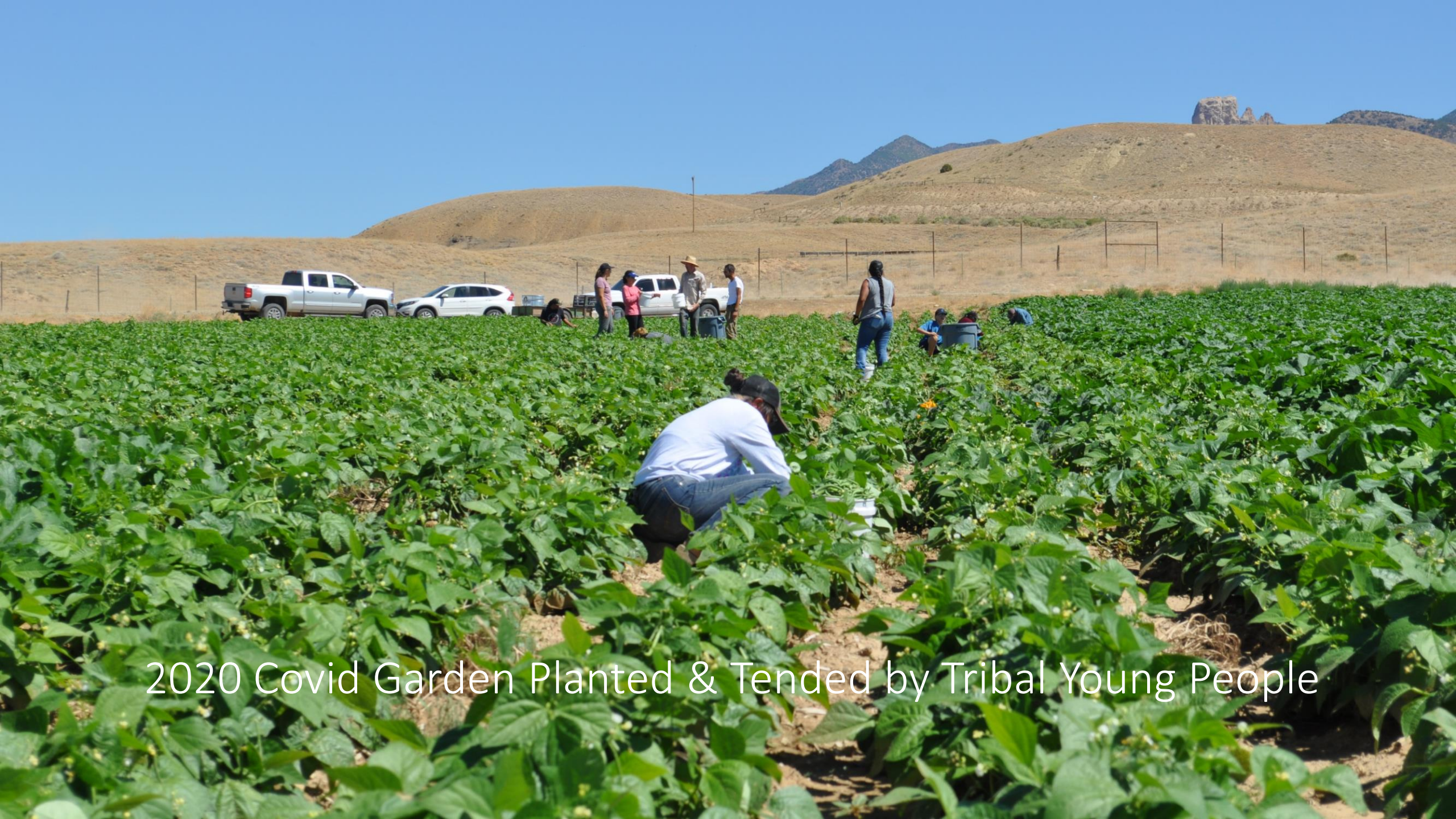
2020 Covid Garden Planted & Tended by Tribal Young People