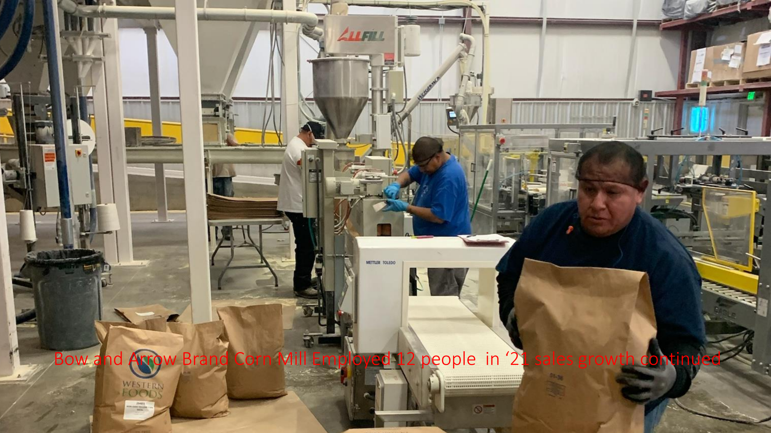
Bow and Arrow Brand Corn Mill Employed 12 people in '21 sales growth continued