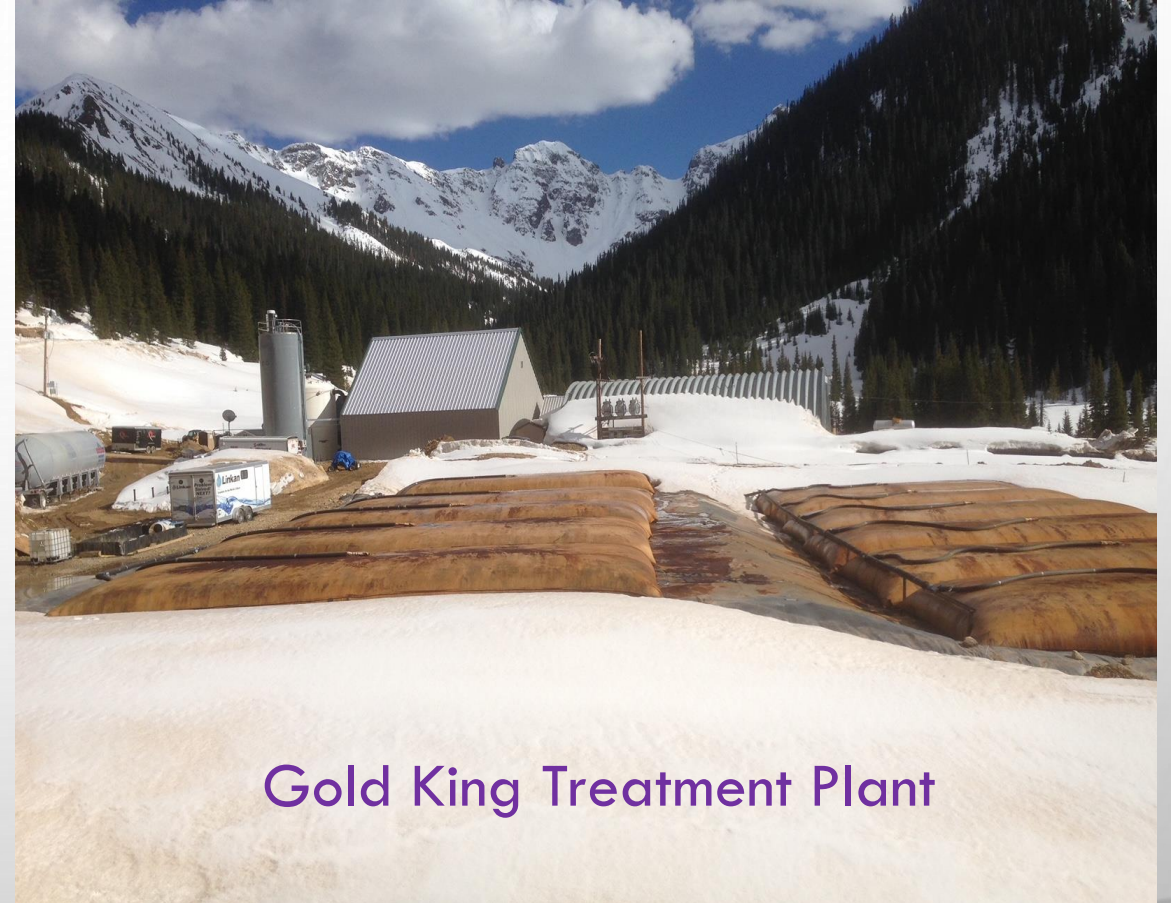
Gold King Treatment Plant