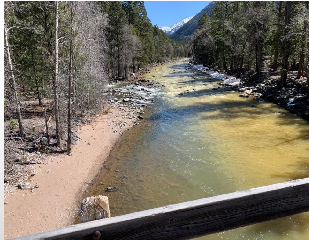
Animas Confluence with Cascade in April