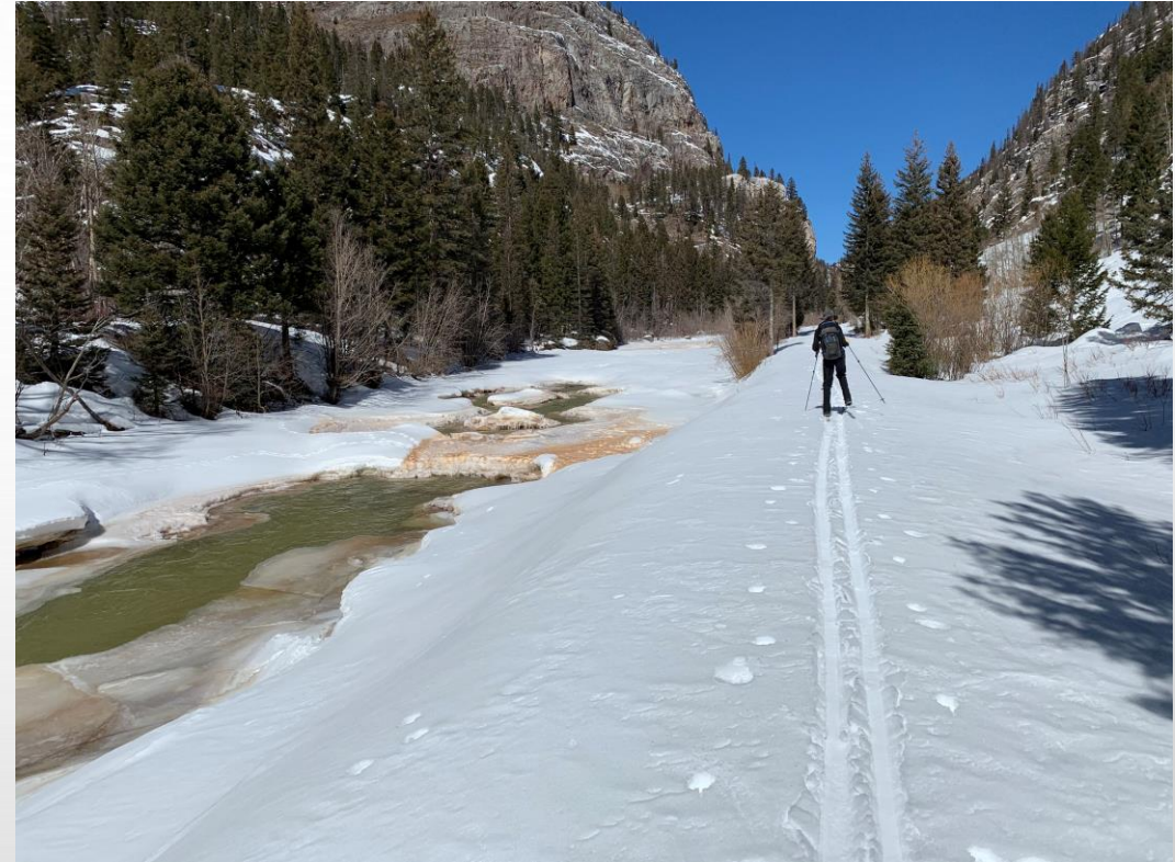
Skiing Down the Tracks from Silverton to Sample