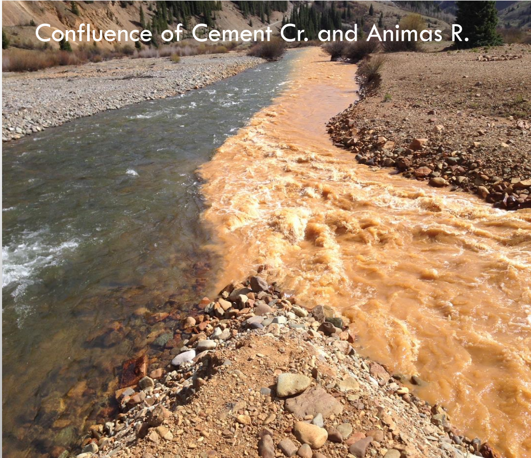
Confluence of Cement Cr. and Animas R.